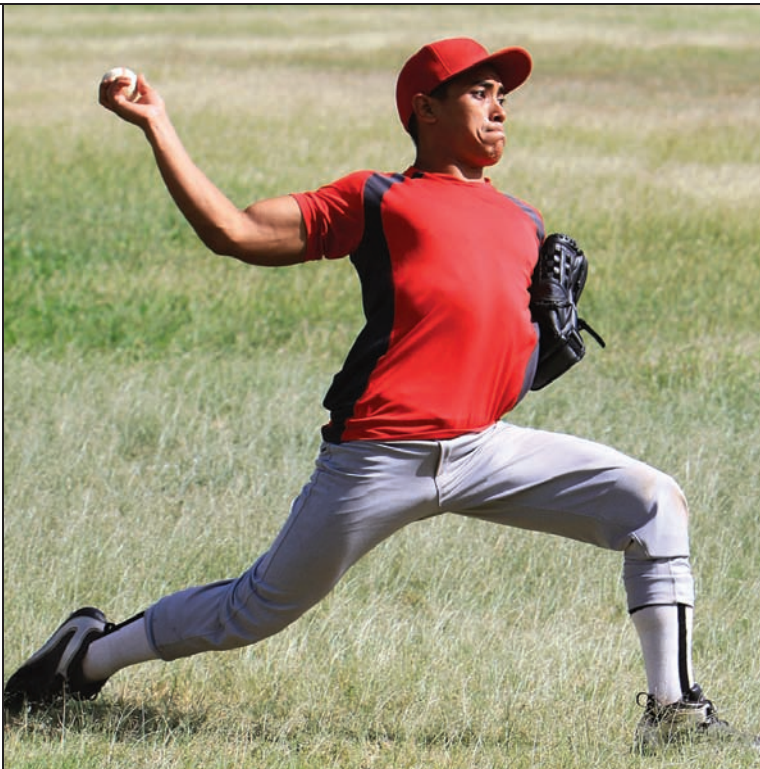
A baby's reaching to turn over is the same pattern that a pitcher uses for throwing.

Key to this technique is the diaphragm, a muscle that assists in breathing, posture