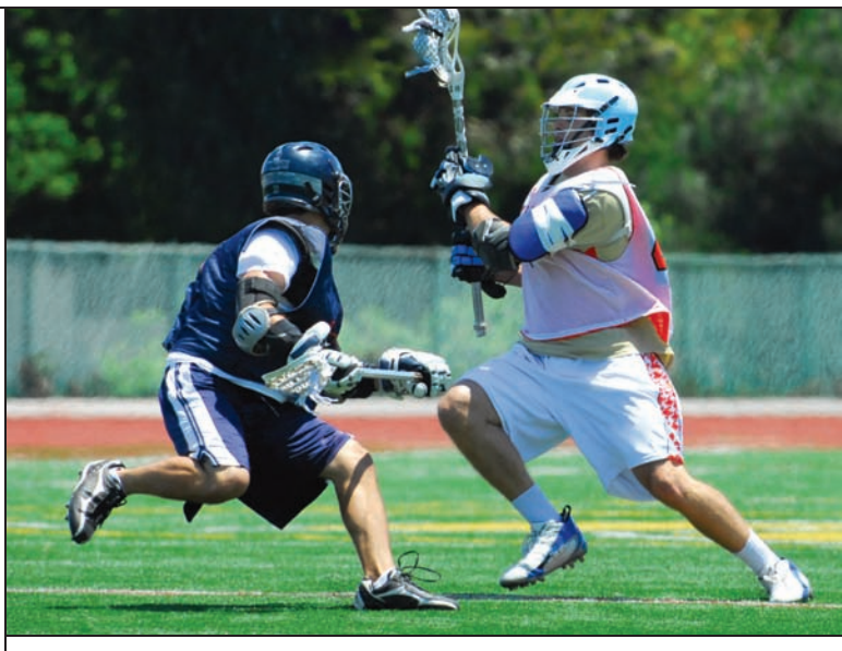
Most ACL injuries are non-contact in nature, such as by stopping quickly and changing direction.

ACL injuries can occur for a number of reasons but most often are of a non-contact vari-