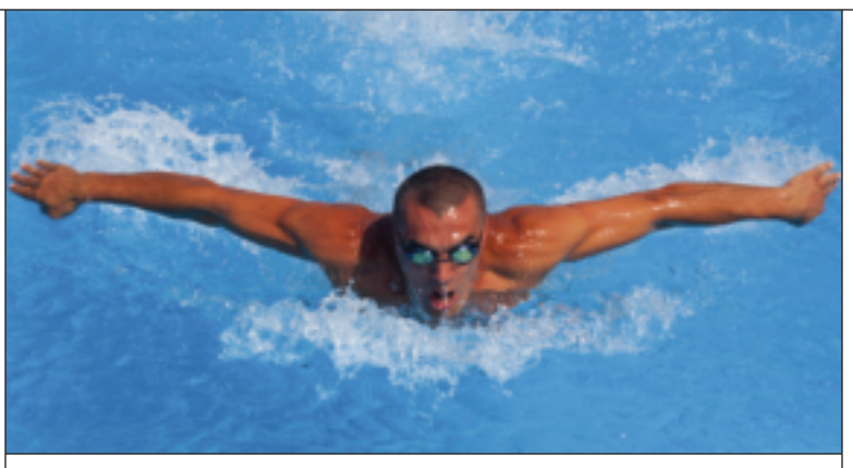
Significant shoulder pain interferes with training among a reported 35 percent of top swimmers.

Swimming is an unusual sport as it demands use of the shoulders and upper extremities